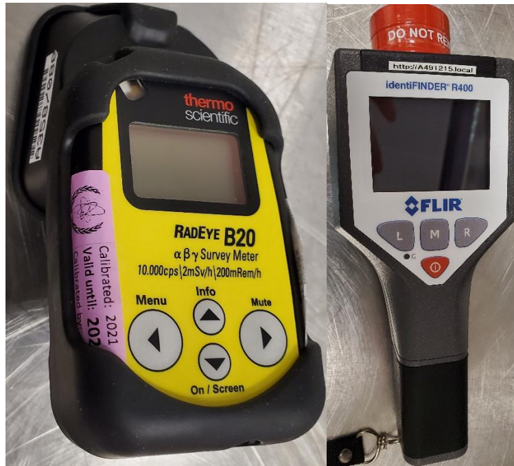
Figure 2 RadEyeB20 and HM5