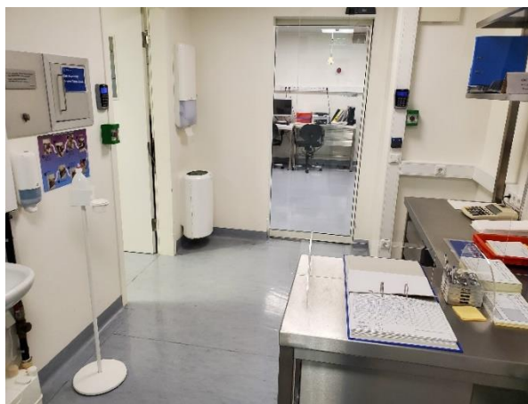
Figure 3 ERML Lobby During COVID-19

ERML management ensured a surplus of all necessary personal protective equipment was available to ERML staff at all times. During the first wave, the supply of several items was limited due to the global shortage; Safeguards used their own capacity (Safeguards Analytical Services Nuclear Chemistry Team) to produce disinfectant liquid for the laboratories and travelling staff.