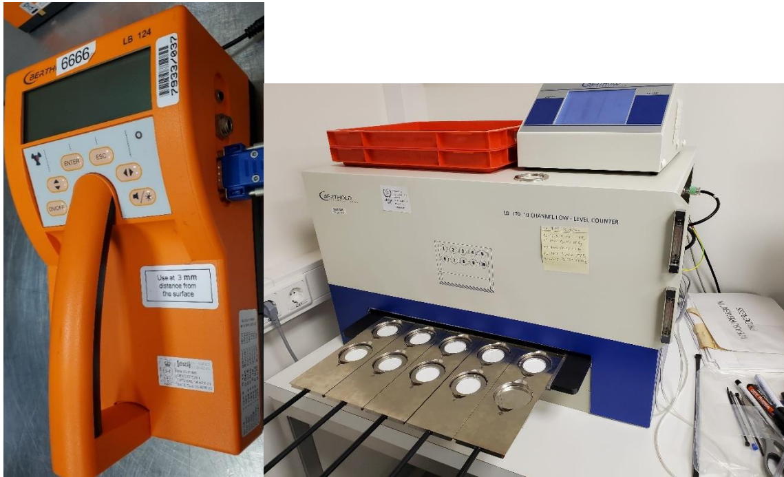
Figure 1 LB124 and LB 770 Monitors

Every year the ERML measures around 30,000 items, broken down into around 15,000 seals, 10,000 items inventoried by Safeguards individually, and 5,000 non-inventoried items; this data is represented by Figure 2.