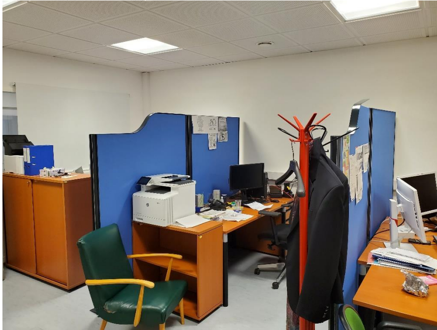
Figure 6 ERML Office Space During COVID-19

For a better dissemination of the constantly evolving information on restrictions, applicable rules, etc., a dedicated webpage was created on the Safeguards intranet. Up-to-date information, answers to frequently asked questions, links to international and national announcements, instructions and safety tips, and PPE availability for staff were uploaded to this portal regularly. This allowed staff to quickly and efficiently access trustworthy information throughout the pandemic and strengthen staff morale.