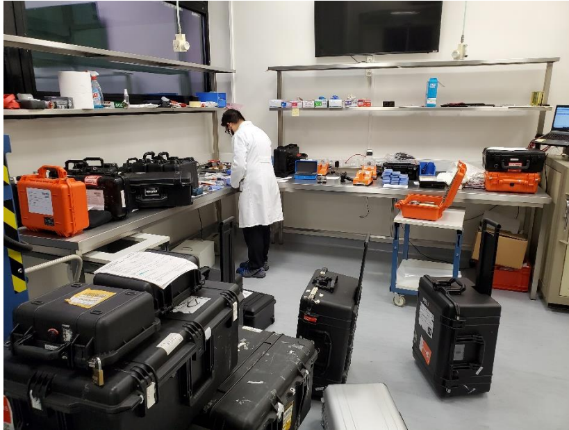
Figure 5 ERML Work During COVID-19

The previously mentioned OEW practical training was also adapted in order to address the evolving pandemic-related requirements. Class sizes were lowered from 8 to 3 to ensure that all staff were able to follow social distancing requirements while the number of sections were increased to be able to still train a similar number of staff members, from 2 in a single day to up to 8 over two days. As up to date training is a requirement for OEWs, it was imperative to continue to train all staff whose training was close to expiring.