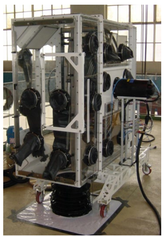
Figure 2. The trepanning tool in the movable containment positioned over a standpipe