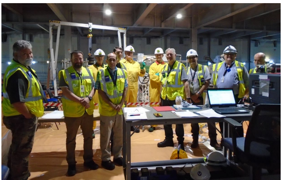
Figure 5. GST and Magnox Staff with the First Reactor 1 Sample on July 18, 2022.

Delays, both expected and unexpected, slow down sampling: