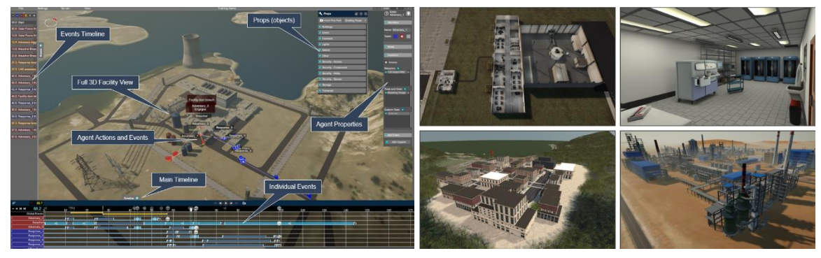
Figure 4. Scribe3D user interface (left); Hypothetical models (right)