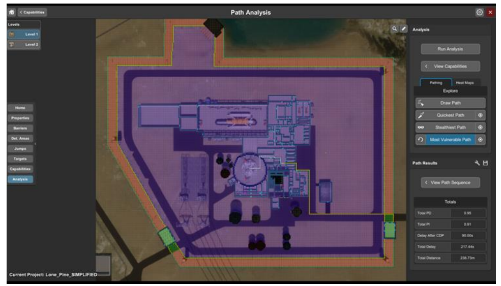
Figure 1. PathTrace user interface

Previous generations of tools such as Systematic Analysis of Vulnerability to Intrusion (SAVI) and Multipath Very-Simplified Estimate of Adversary Sequence Interruption (MPVEASI) used simplified adversary sequence diagrams which produced abstract, mathematical models of facilities. PathTrace is based on the same algorithms of these predecessor tools, but features a 2D site layout, which makes building the model, presenting results, and training on the tool much more accessible without sacrificing analytical validity.