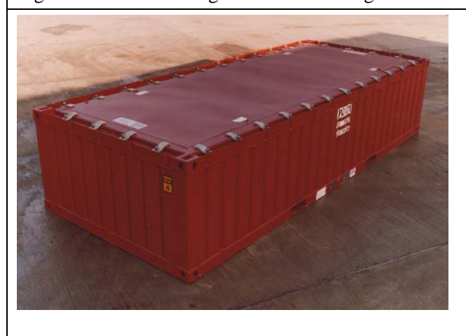
Figure 7. IP-2 ISO Freight Container Design # 2910