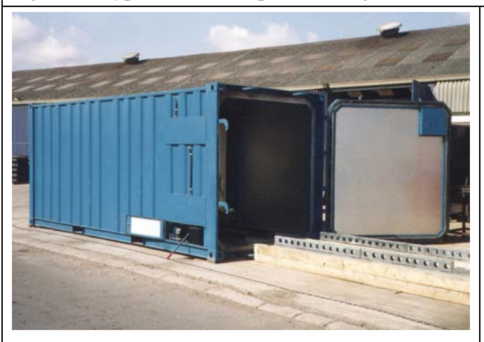
Figure 11. Type B Contents Special Arrangement ISO Freight Container Design #2913