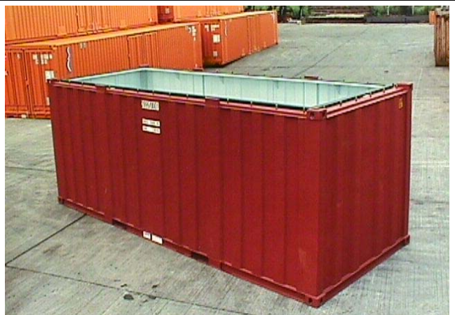
Figure 4. IP-2 ISO Freight Container Design # 2899 (shown with lid off)