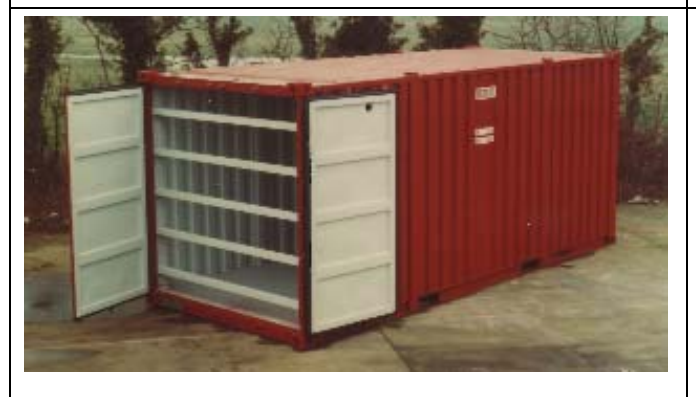
Figure 5. IP-2 ISO Freight Container Design # 2031