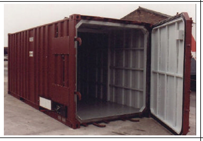
Figure 3. IP-2 ISO Freight Container Design # 2896