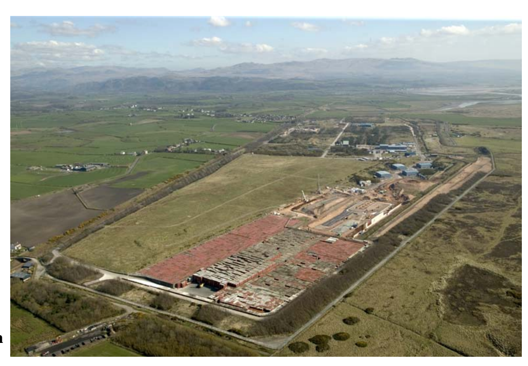
Figure 15. LLWR waste burial site at Drigg

Since the first introduction in 1988 of the use of IP-2 ISO Freight Containers for the shipment and disposal of LLW in the UK, about 10,000 IP-2 ISO Freight Containers have been emplaced in the vaults at Drigg. Figure 15 shows Vault 8 at Drigg in 2009. The majority of the containers that can be seen in the vault are half height IP-2 ISO Freight Containers (Design #s 2895, 2032, 2910 and 2947).