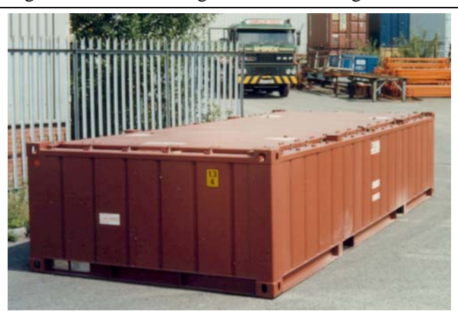
Figure 2. IP-2 ISO Freight Container Design # 2895