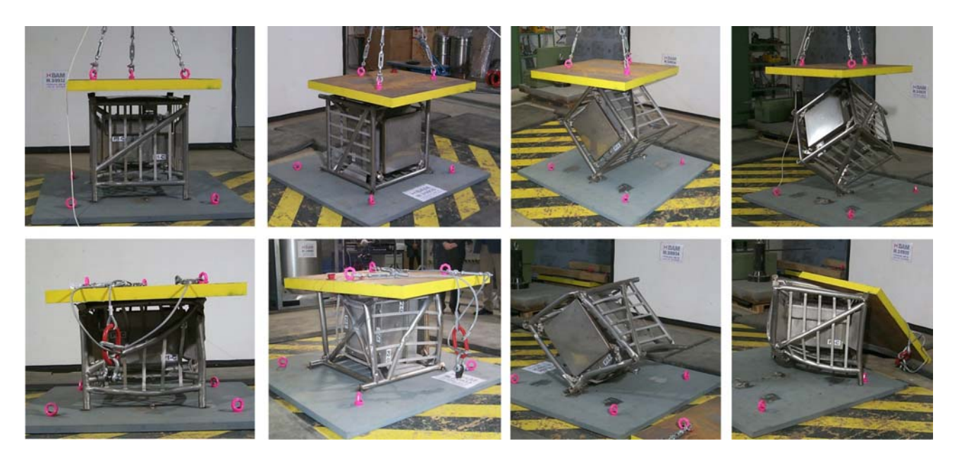
Figure 5. Dynamic crush test configurations for the ANF-50 (first line) with results after crush testing (second line).

the same density as uranium-oxide. The content mass was 57 kg, so that the total mass of the package was 229 kg.