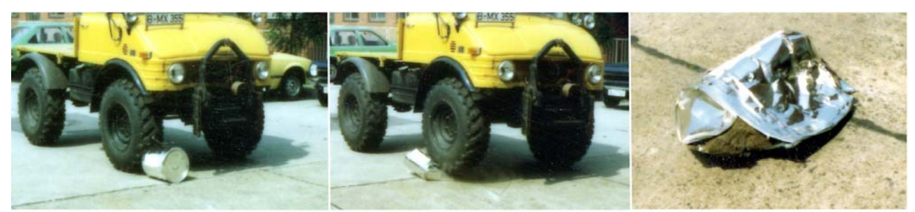
Figure 3. BAM Demonstration Package crushed by a truck run over

Nearly every package was deformed such that the total failure of the inner container could be detected, liquid content poured out, e.g. see Fig. 3. The tests showed that for light weight packages the test impacts required by the transport regulations at that time did not create the highest possible damage.