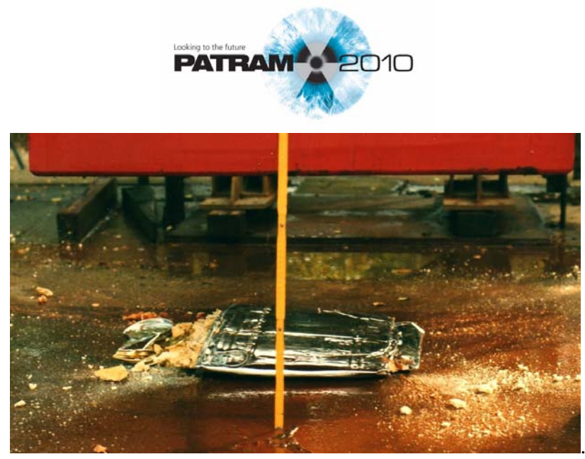
Figure 2. Crushed BAM Demonstration Package which met the IAEA requirements

All crush tests which were carried out by BAM with the BAM Demonstration Package led to total rupture of the package.