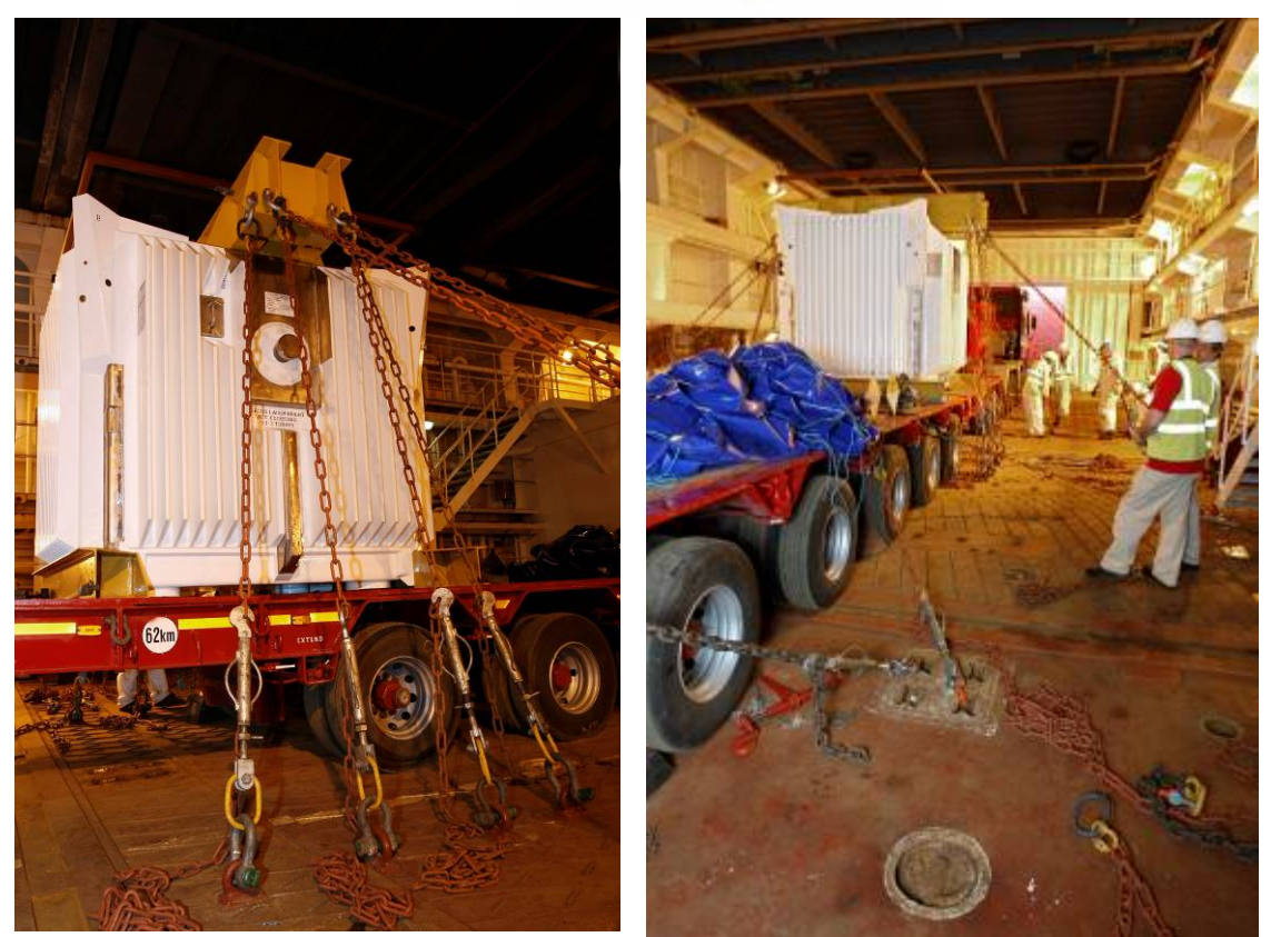
Figure 2 (left shows package tied down to ship, right shows lorry tied down to ship)