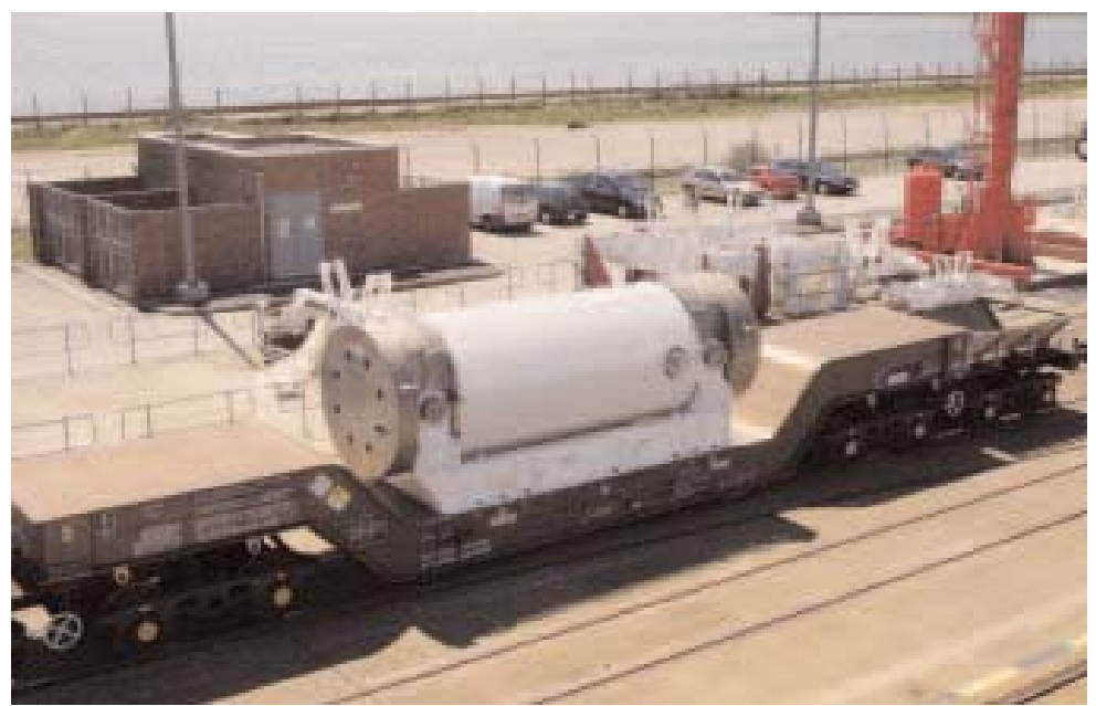
Figure 1 Flask on a rail wagon.

An example of a flask on a rail wagon can be seen in Fig 1. This picture comes from the IAEA TranSAS appraisal of the UK (Ref 6). It can be seen that there are very rigid connections between the flask and the conveyance via trunnions.