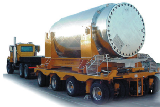
NRC photo of empty container on truck