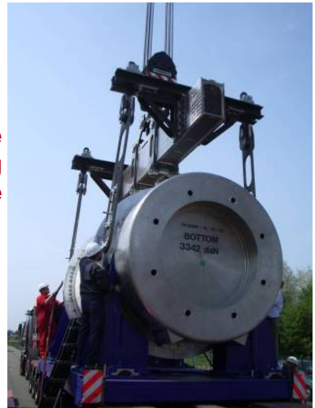
New frame and handling device