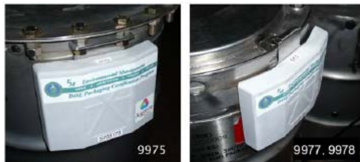
Figure 1 RFID Tag Detail

The RFID contains four A-size Li-SOCL 2 non-rechargeable batteries each with a nominal energy capacity of 13 W-h. Given the robust nature of the host package, there are no hazards associated with these batteries that can affect package safety performance. 2