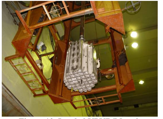
Figure 10. Loaded VPVR/M cask basket being transferred into the Building 101A hot shop/pool area.

Building 101A is a larger hot shop with remote operations capabilities for handling casks and SNF