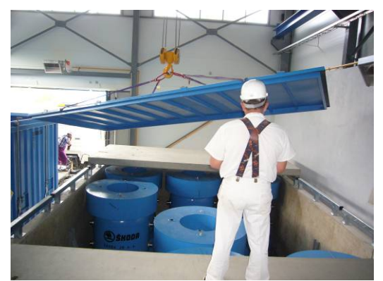
Figure 8. High-Level Waste Storage Facility extension cask storage vault.

Figure 7. Cask transfer device on rails into the High-Level Waste Storage Facility entrance hall.