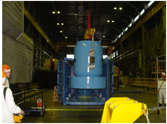
Figure 9. Cask unloading from the International Shipping Organization container in Building 855.

assemblies (see Figure 10). Specialized remote-handling equipment and tools were installed for handling the VPVR/M cask system and NRI SNF. Examples include cameras and lighting, а special fuel basket loading/unloading grapple, and a special basket on a modified storage pool fuel-handling cart. A high-pressure heated water decontamination facility was setup for cleaning the cask baskets before reinstallation into the casks. Finally, tools and equipment needed to reassemble, seal, and leak test the casks in preparation for transport were provided.