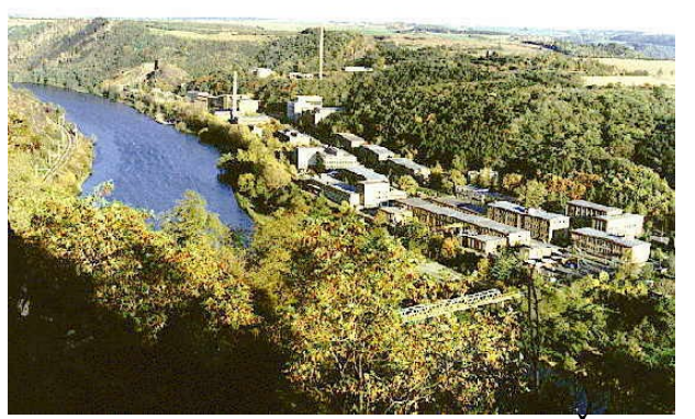
Figure 1. Nuclear Research Institute, Řež.

NRI owns and operates a LVR-15 Russian-designed type research reactor (see Figure 2). The reactor is a light-water moderated and cooled tank nuclear reactor with forced cooling. A combined water-beryllium reflector is used. The reactor was placed in operation in 1957 and operated until 1974 when it was upgraded to 10 MWt and the fuel was changed to the IRT-2M configuration with 80 weight percent <sup>235</sup>U. It then operated until the core was converted in 1996 to IRT-2M fuel with 36 weight percent <sup>235</sup>U with 3 or 4 tubes. Plans exist for further reducing the enrichment of the core to 19.7 weight percent <sup>235</sup>U fuel of the IRT-4M. NRI has 343 HEU SNF and 206 LEU SNF assemblies available for return to the Russian Federation.