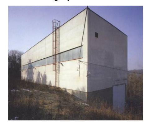
Figure 6. The High-Level Waste Storage Facility.

The HLWSF (see Figure 6) is located on a hill overlooking the main NRI complex. Preparing the HLWSF for fuel and cask-handling operations involved upgrading the overhead crane (adding a nomadic load cell and speed controls),