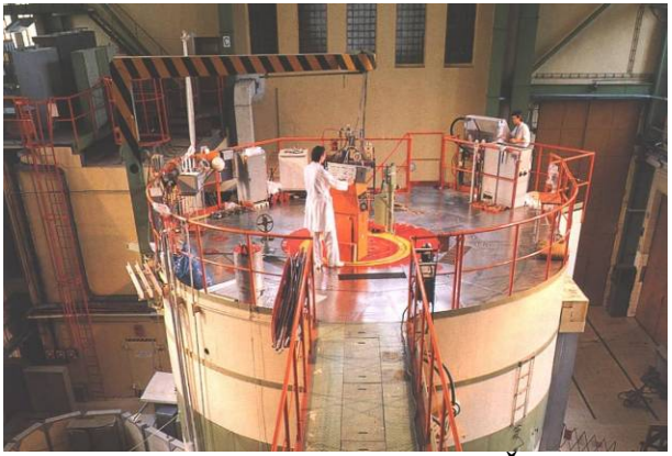
Figure 2. LVR-15 reactor at Řež.

In 2004, the U.S. Department of Energy (DOE) began negotiating NRI's participation in the RRRFR Program. In March 2005, an umbrella contract was signed for NRI to perform all activities needed to prepare for transporting their HEU SNF to the Russian Federation. In May 2007, the contract was amended to include actual HEU SNF handling, transport, and disposition.