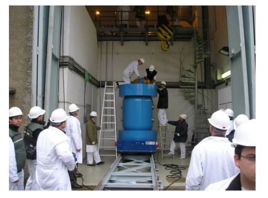
Figure 7. Cask transfer device on rails into the High-Level Waste Storage Facility entrance hall.

An extension was built onto the front of the HLWSF for handling and storing the transport casks. A cask transfer device on rails was installed in this extension (see Figure 7). A specially designed cask storage vault, used for storing both the loaded and empty VPVR/M casks, was installed on one side of the extension. This vault is designed to protect, isolate, and provide physical protection for the casks during storage at NRI (see Figure 8).