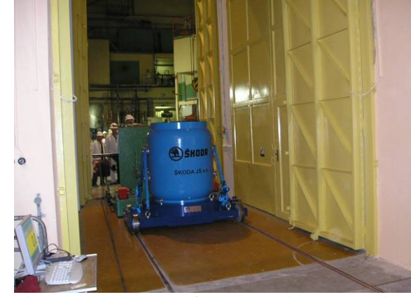
Figure 4. LVR-15 reactor At Reactor Pool for spent nuclear fuel storage.