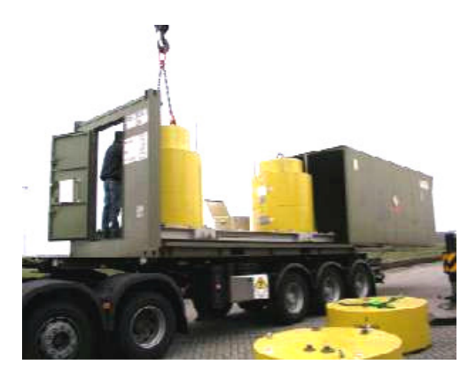
Figure 4. Standard MOSAIK container as interim storage container and in transport configuration with shock absorber in the 20'-Open-All-Container