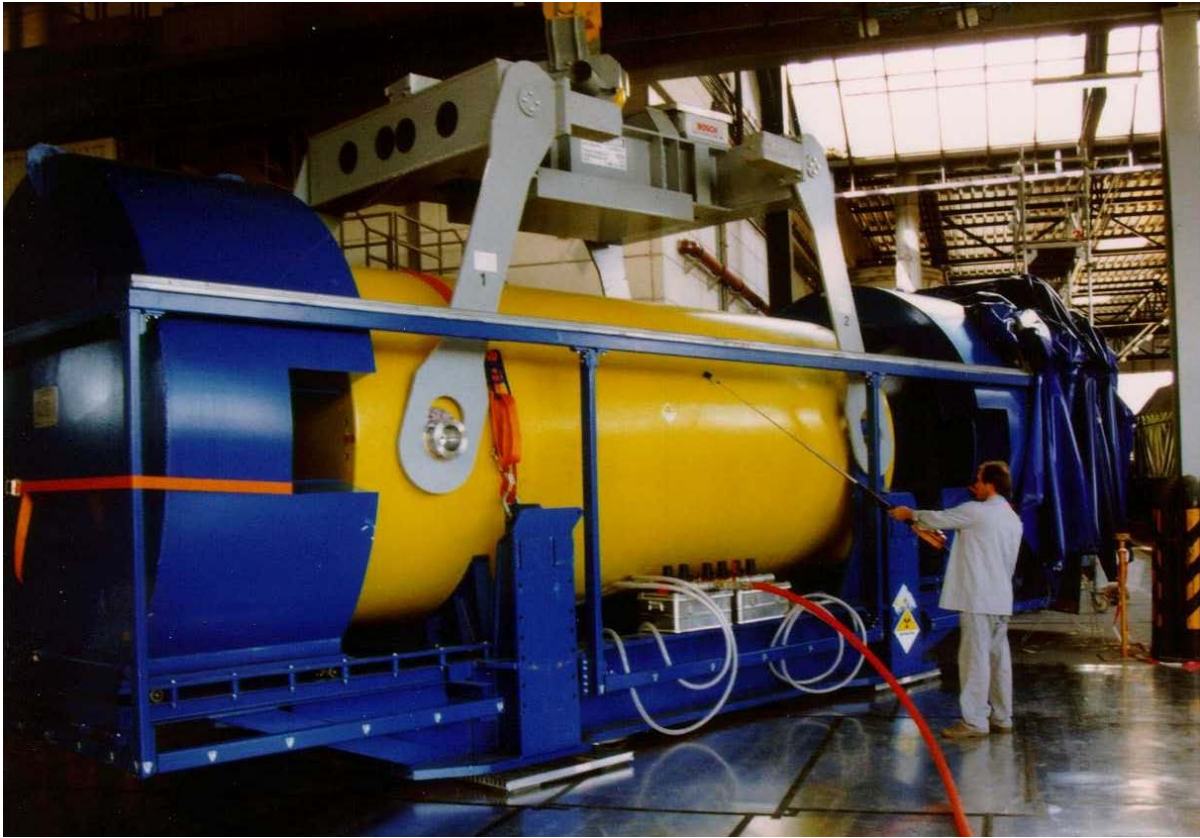
Fig. 4. MOSAIK® 80 T with transport equipment