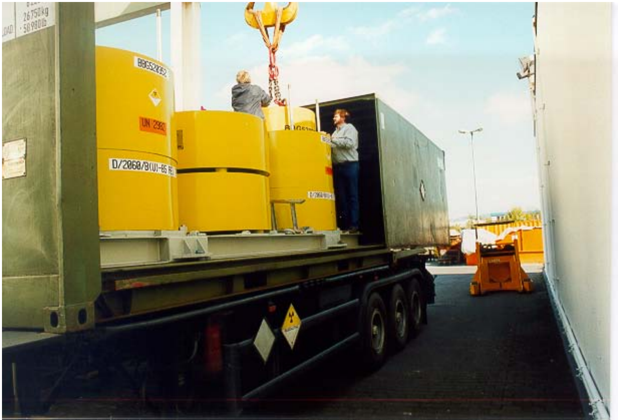
Fig. 3. MOSAIK® II casks with shock absorbers