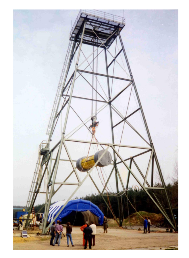
Fig. 1. 9 m drop with the POLLUX cask

The remarkable distribution of ductile cast iron as material for Type B packages can be surely put down to the evolution of the casting technology and the improvement on the safety relevant material properties especially at thickwalled castings. On the whole the material quality at the serial production of casks has improved considerably since the publication of the first safety concept [5]. Particularly