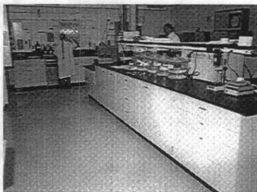
Figure 3. Testing Facilities.

The ETL is a state-of-the-art laboratory which includes environmental chambers having the capability to routinely achieve temperatures from -80°C to 200°C. Mechanical testing equipment such as a Universal Testing machine and associated computerized control equipment can perform a variety of tensile and compression testing operations. Figure 3 shows a view of the ETL along with the previously mentioned capabilities. Not shown is equipment to perform Shore hardness measurements, stress cracking, specific gravity