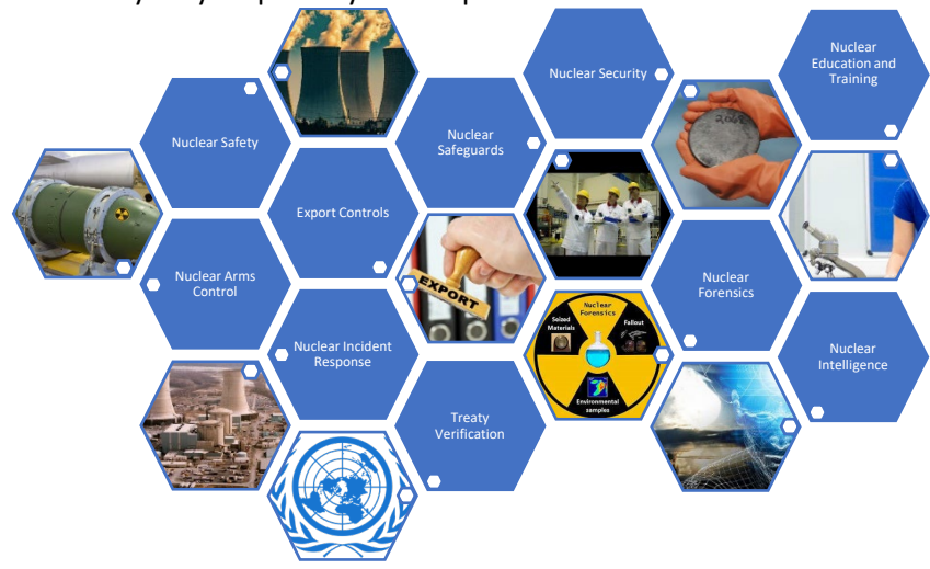
Figure 2. Some of the key components of the nuclear nonproliferation (NN) workforce

Figure 2 and Table 1 are presented to help illustrate the breadth and depth of the NN profession. These images are relatively preliminary and are based on perceptions instead of the results of actual data collection. Yet they may help clarify the scope of the NN workforce.