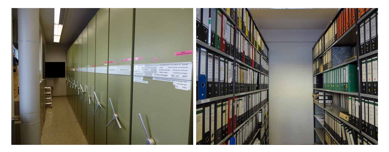
Figure 1: Example pictures from the KTE archives.

commissioned from 1986 to 1996 by Kernforschungszentrum Karlsruhe (KfK), and now, the reactor block is in secure containment. All auxiliary buildings, released from the controlledarea regime, are either demolished or used for other purposes no longer under German atomic law [11], e.g. , the former reactor building ( rotunda ) now hosts an exhibition. The dismantlement of MZFR started in 1987 and is currently ongoing. So far, the reactor core vessel has been dismantled, and the activated areas of the biological shield have been removed [9]. Now, the demolishment of auxiliary buildings is being finished, and the complete dismantlement of all buildings is expected to be completed by 2030 [12].