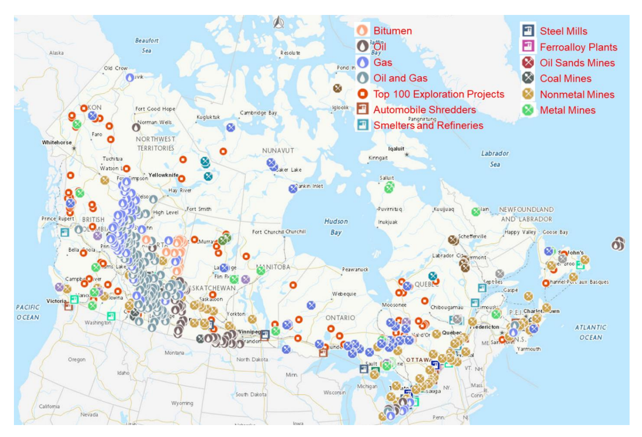
Figure 1: Locations of Mining, Minerals, and Top 100 Exploration Projects in Canada [5]

Proceedings of the 2023 INMM/ESARDA Annual Meeting 2023 May 22-26, Vienna, Austria