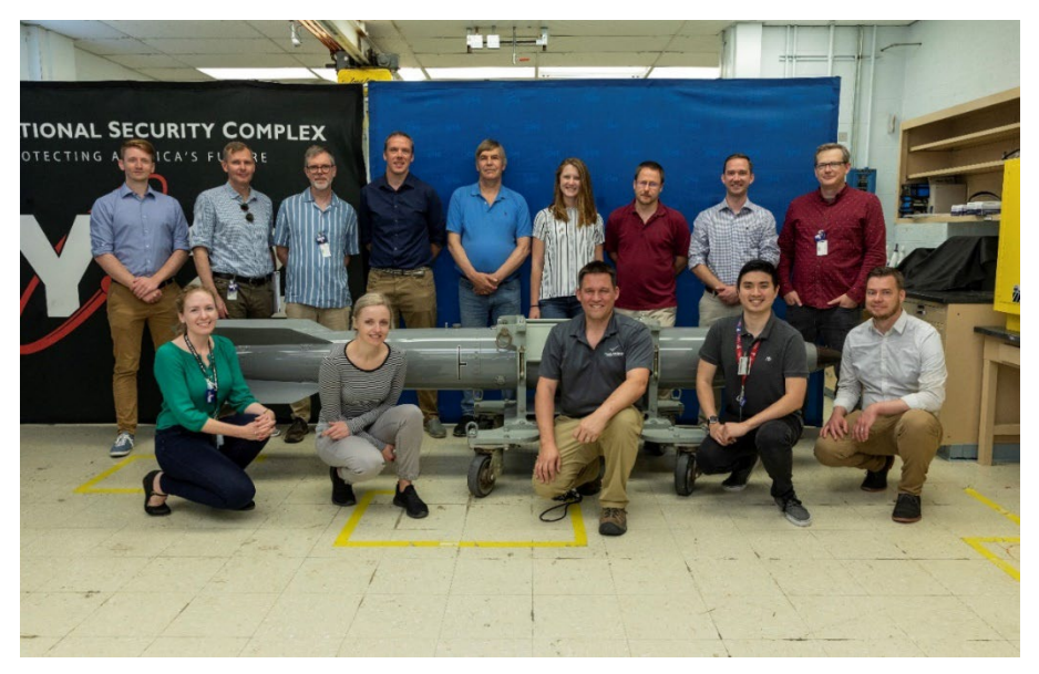
Figure 2. DAD Participants with a mock nuclear weapon