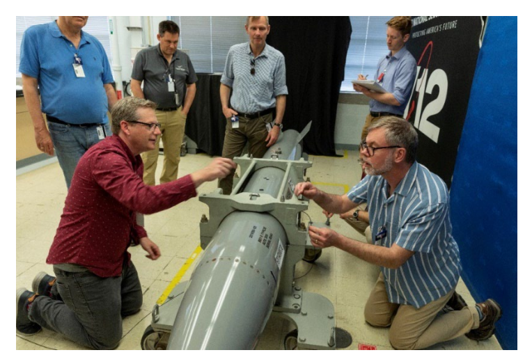
Figure 4. Installation of CoCIM 2 by the Inspection Team

The participants broke for lunch, and the Inspection Team reviewed data generated thus far on Day 1. The Inspection Team then confirmed CoCIM 1 visually and tactilely, data was read-out by the host, CoCIM 1 was removed by the Inspection Team, and data was read-out by the host again. This process was repeated for the removal of CoCIM 3. The fiber optic loops were re-inserted in both CoCIMs to register a "close" event, and they were stored in the inspection area to await post-use inspection the following day. A summary of off-normal events for each CoCIM may be found in Table 2.