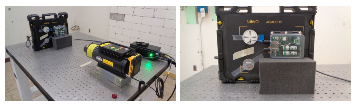
Figure 5. X-ray Radiography during Post-use Inspection Activities